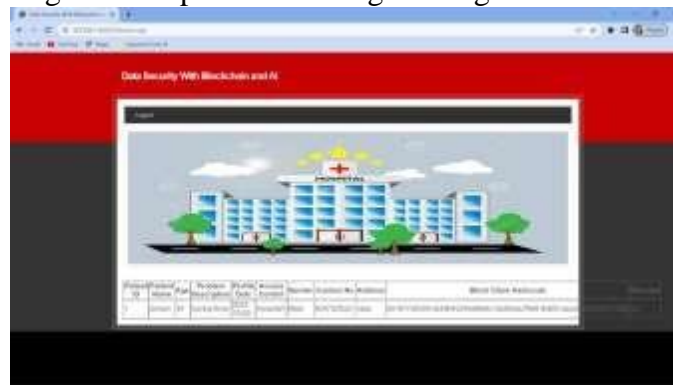
Fig 6:- In above screen Hospital1 getting details of patient and Hospital2 not having permission so it will not get details. To see this logout and login as Hospital2.