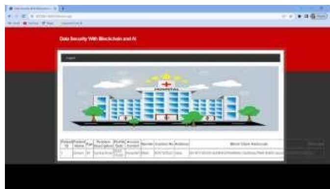
Fig 7:- In above screen we can see patient all details and hash code generated by block chain and in last column we can see patient reward revenue as 0.5 and it will get update upon every access from hospital user.