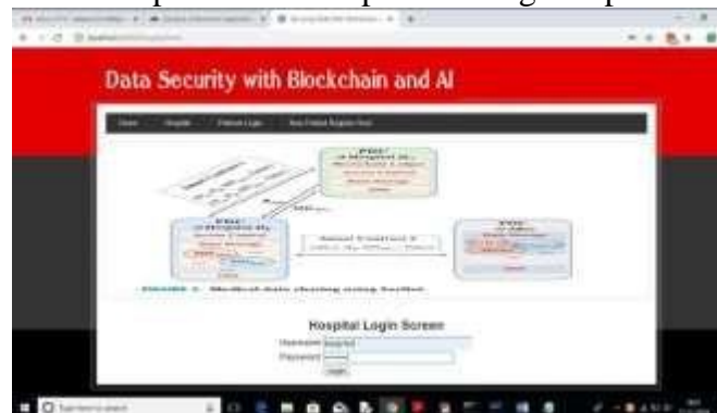
Fig5:- In above screen to login as Hospital1 click on ‘Hospital’ link to get above screen. Use ‘Hospital1’ as username and ‘Hospital1’ as password to login as Hospital1 and use Hospital2 to login as Hospital2. After login will get below screen