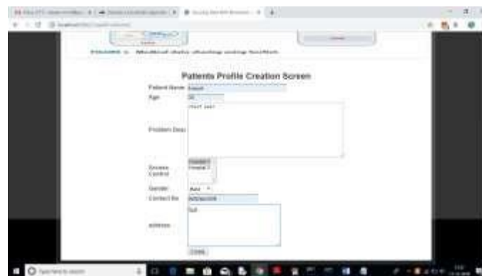
Fig 3:- In above screen I am adding patient disease details and selecting ‘Hospital1’ to share my data and if you want to share with two hospitals then hold ‘CTRL’ key and select both hospitals to give permission. Now press ‘Create’ button to create profile