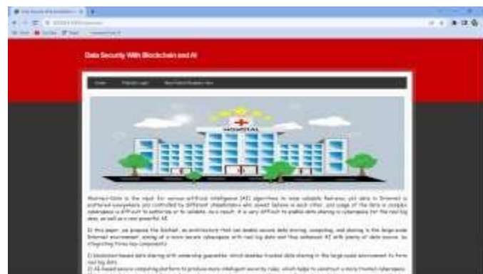
Fig 2: _ In above screen click on ‘New Patient Register Here’ link to get below screen